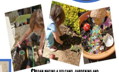
WE CAN MAKE A VOLCANO, GARDENING AND MAKING A BEAUTIFUL FAIRY GARDEN!