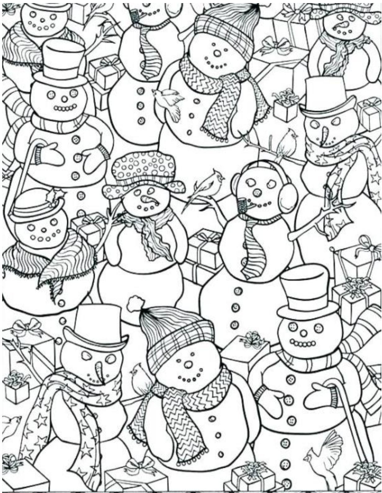
WINTER COLOURING PAGE