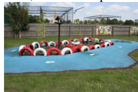
Our new race track!

Over half term a willing team of Friends volunteers, led by Mr Wing, redeveloped the site where the old pirate ship once stood. They created a race track, complete with pit stops and crash barriers! The Friends were also very lucky to secure generous donations of plants from various local garden centres, including: Wards Nursery, Thaxters Garden Centre and Norfolk Bamboo. The outdoor classroom is taking shape too. We are just waiting for some wooden seating to arrive. This has been funded by generous donations from the Snettisham Buffaloes, as well as the money raised for taking part in the Mini-Gear event in King's Lynn. This money will also be used to pay for our new refrigerator; this will help to keep the children's lunchboxes cool.